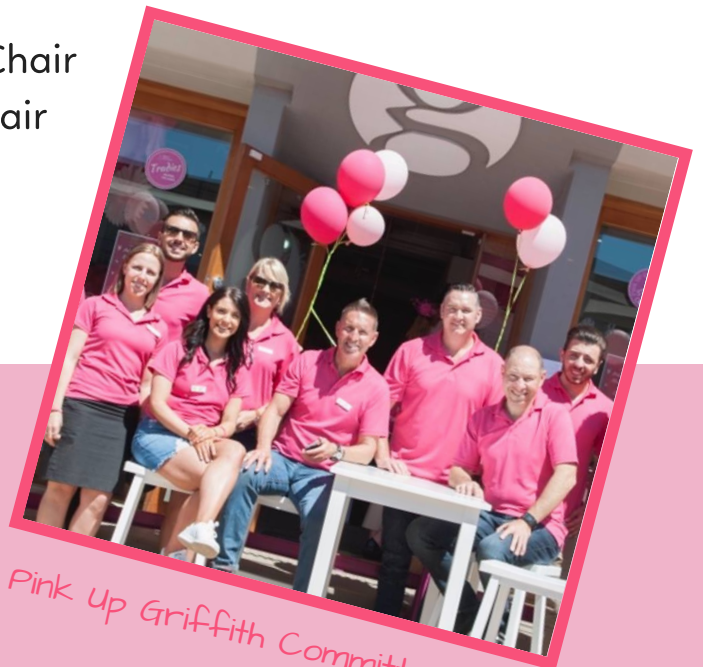
Pink up Griffith Committee 2017